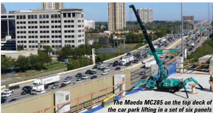
The Maeda MC285 on the top deck of the car park lifting in a set of six panels

The MC285 was able to drive to the top deck of the car park structure under its own steam, thanks to its compact dimensions, low weight and low ground bearing pressure, thus avoiding the need to wait for the heavily utilised tower crane. The MC285's load moment limiter combined with its outrigger interlock system made lifting the various weight panels from the floors below safe and efficient.