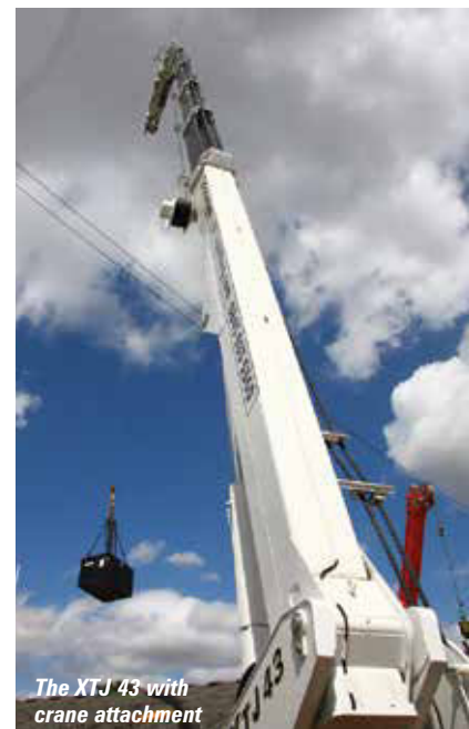
The XTJ 43 with crane attachment

"The XTJ 43 recently went out on a job installing 500kg skylights on a very restricted building refurbishment in Shepherds' Market in Mayfair, London, after several other companies were unable to supply a machine to do the job. Nothing else, including mini cranes, trailer cranes, telehandlers etc, was