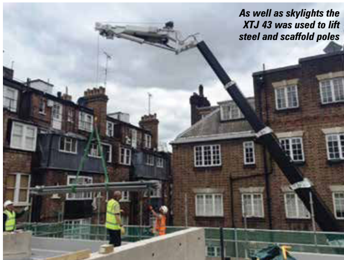
As well as skylights the XTJ 43 was used to lift steel and scaffold poles

including steel and scaffold poles onto the roof area. No other equipment - including mini cranes, trailer cranes, telehandlers etc - could fit into the very congested and space restricted area which also had low floor loading - and then lift loads to 38 metres high and nine metre radius. As a result of this we decided that in future when we add more Palazzani's - particularly the XTJ models - we will also specify the crane attachment option."