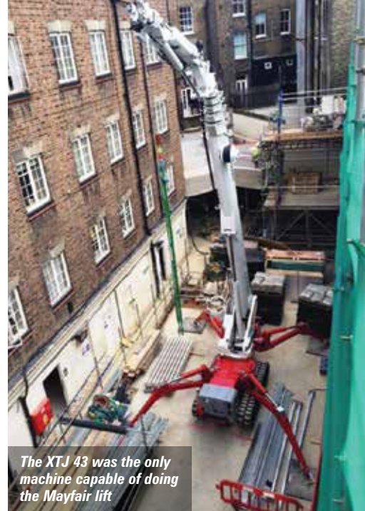
The XTJ 43 was the only machine capable of doing the Mayfair lift

While scouring the market for machines that may have been suitable for that contract it also looked at the Jekko mini cranes.