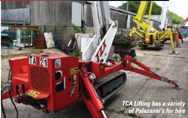
TCA Lifting has a variety of Palazzani's for hire