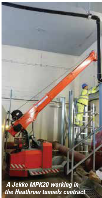
A Jekko MPK20 working in the Heathrow tunnels contract

eight tonnes it was helped by the introduction of two new models, the 7.5 tonne Jekko SPX1275 and the eight tonne Maeda MC-815. The two had initially looked at the new six tonne Jekko SPK60 crawler crane and has ordered one for delivery this month - but saw the SPX1275 and was impressed with its features, build quality and performance.