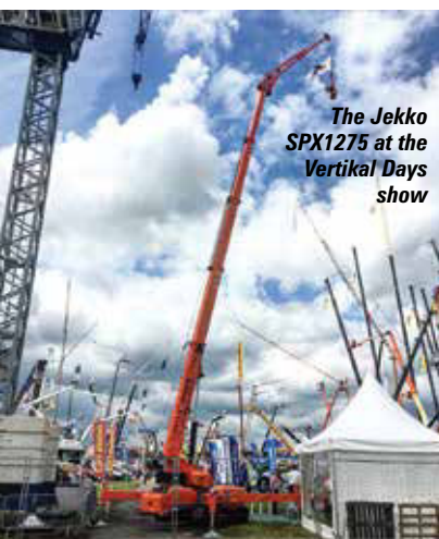
The Jekko SPX1275 at the Vertical Days show

The Jekko uses a different design concept to the Unic or Maeda cranes - both of which feature traditional spider leg outriggers and an off-centre superstructure - with a X-type cruciform outrigger arrangement with centrally mounted superstructure. This means that the rest of the chassis does not need cope with the loads imposed during lifting. The reliability of the new Jekko cranes over the longer term is still unknown, the manufacturer's first models while technically ingenious, were notoriously unreliable. However over the past decade or more the cranes have evolved beyond all recognition and gained a much more positive reputation. TCA says that its MPK20 has performed well and been very reliable. It has some exceptional