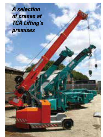
A selection of cranes at TCA Lifting's premises