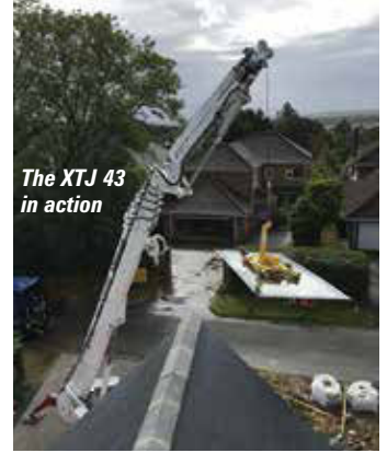
The XTJ 43 in action

competition in that both the Unic and the Maeda cranes are 'bullet proof'.