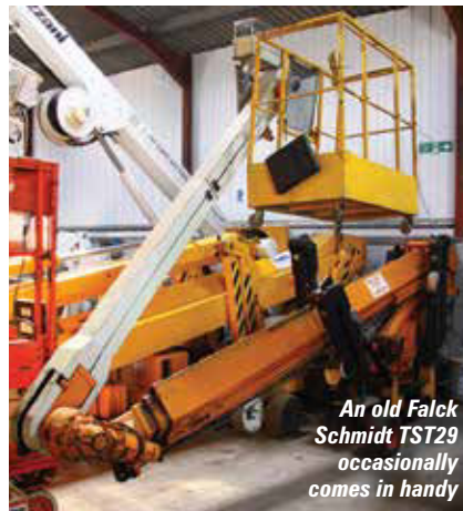
An old Falck Schmidt TST29 occasionally comes in handy