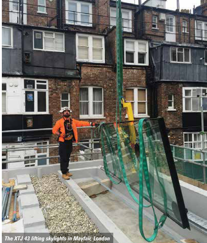
The XTJ 43 lifting skylights in Mayfair, London

"During the 11 years we have been in business, the spider/mini crane